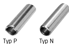
Typ P Typ N

The annular, stainless steel reinforcement of the membrane body T-6900 R enables operation at pressures of up to 9 bar. Both the T-96 and T-6900 membrane bodies are Teflon-coated, and therefore optimally protected against the aggressive influences of CIP and SIP cleaning cycles. On the other hand, the membrane bodies S-96 are coated with a layer of silicone, which is thinner than a Teflon layer. This reduces the response time t_{98\%} from 90 sec. to 60 sec. All membrane bodies are supplied complete with material certificate.