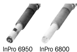
InPro 6950 R InPro 6800